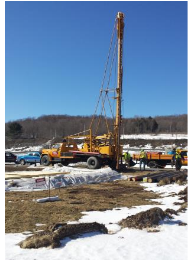
Installing New Groundwater Wells