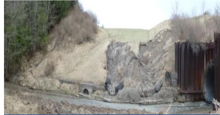
Lake 1 Spillway Erosion Before Repairs