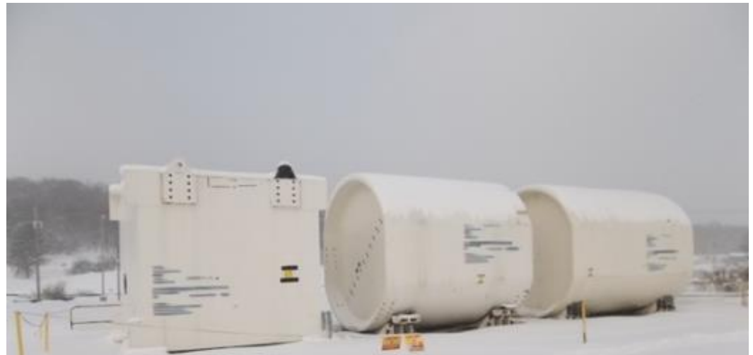
Vitrification Melter, Concentrator Feed Make-up Tank and Make-up Feed Hold Tank