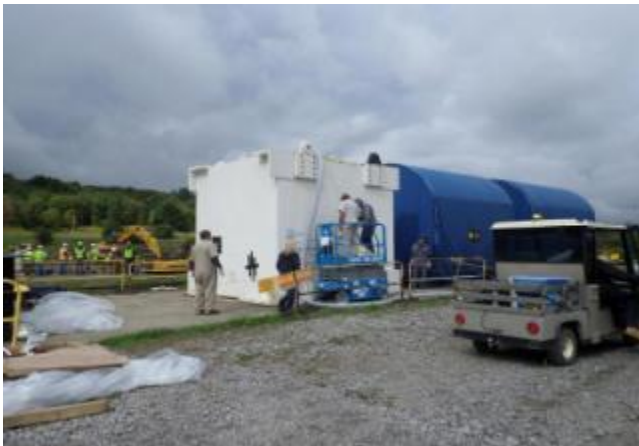
Melter Grouting Operations