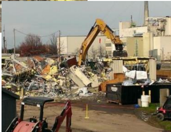
Open Air Demolition