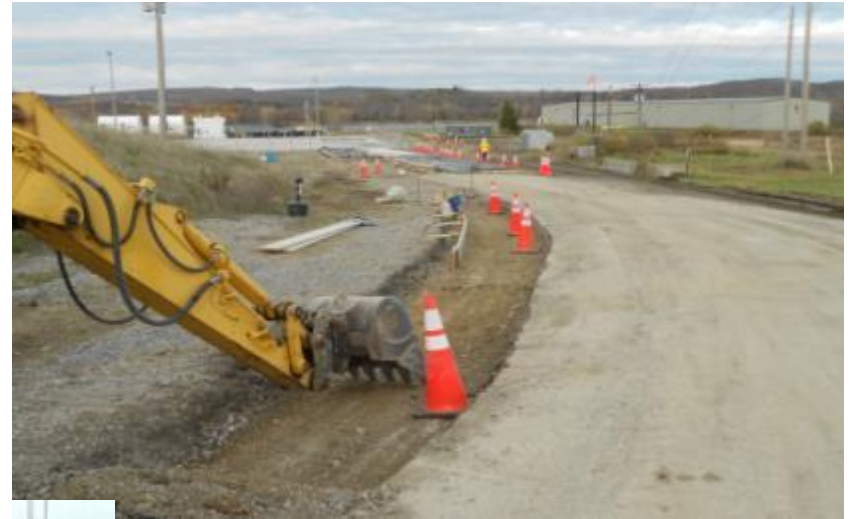
HLW Haul Road Upgrades