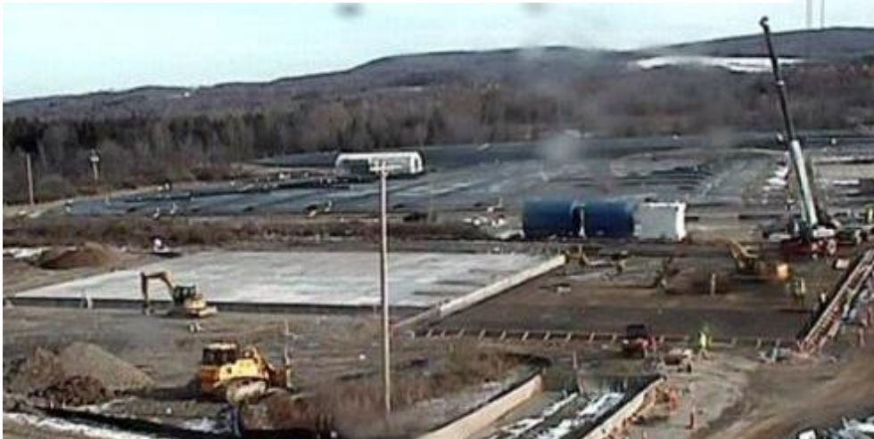
HLW Pad Construction