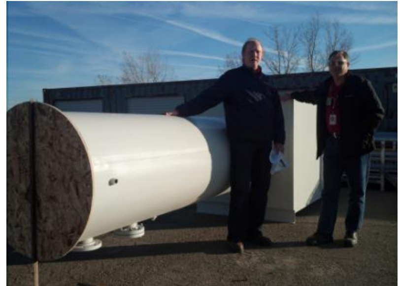
Part of Replacement Ventilation Unit (RVU)