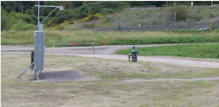
Completed Well 1 Showing Electrical and Wireless Panel