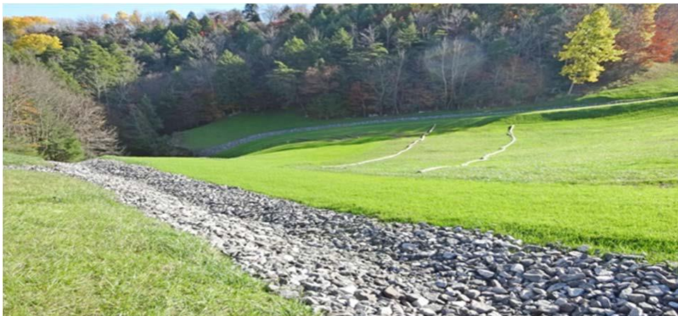
Lake 2 Dam Repair