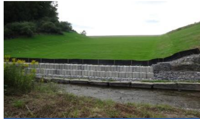
Lake 1 Spillway After Repairs